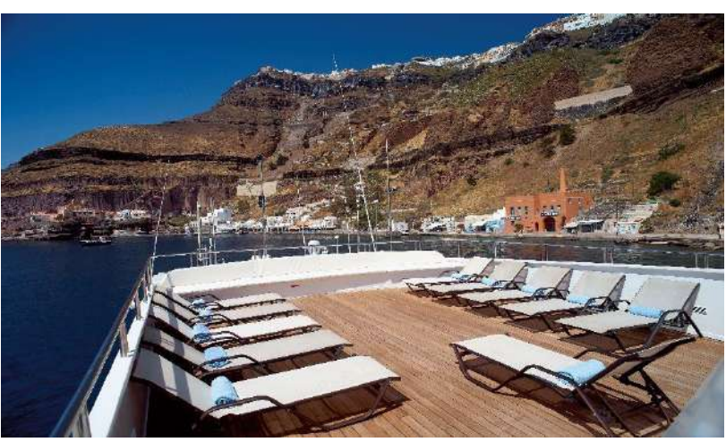
January 3, 2023