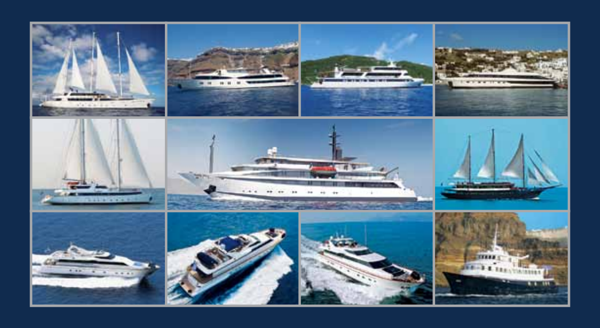
The Variety Cruises Small Ships