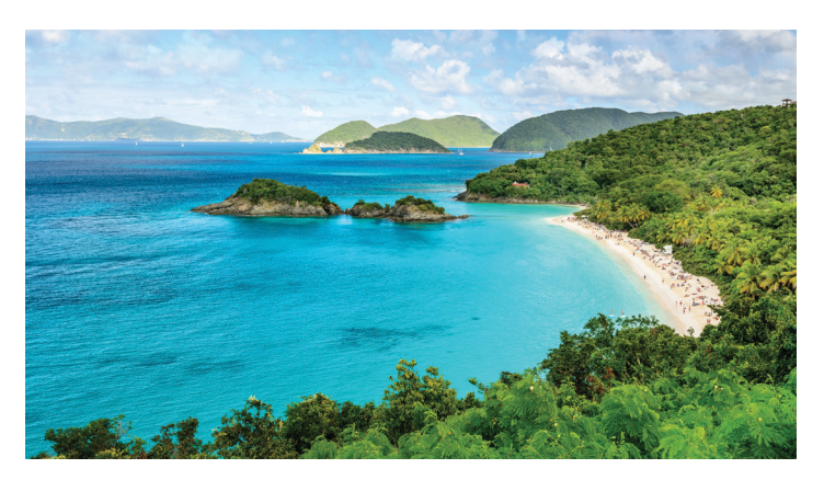
CARIBBEAN Private Coves & Turquoise Water

From November through April take advantage of SeaDream's Caribbean. The natural beauty of the Caribbean, with its miles of beaches, private coves and brilliant turquoise water is brought to life with the casual luxury of a SeaDream yacht. Each voyage is designed to highlight the Caribbean's colorful sightseeing, wonderful dining and nightlife.