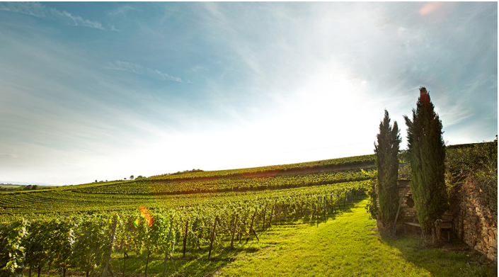
UNIQUE PROGRAMS Wine Voyages

SeaDream's Transatlantic voyages; lazy days at sea are the perfect opportunity to enjoy the unparalleled luxury and service provided on a SeaDream yacht. Transatlantic voyages are about reading that book you have never gotten around to, sleeping in because you can, rejuvenating with spa treatments and enjoying fabulous breakfasts, lunches and dinners without a schedule. Revitalize your senses and take in the sea air.