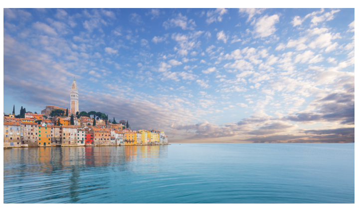
MEDITERRANEAN From the Portuguese coast to the Black Sea

From November through April take advantage of SeaDream's Caribbean. The natural beauty of the Caribbean, with its miles of beaches, private coves and brilliant turquoise water is brought to life with the casual luxury of a SeaDream yacht. Each voyage is designed to highlight the Caribbean's colorful sightseeing, wonderful dining and nightlife.